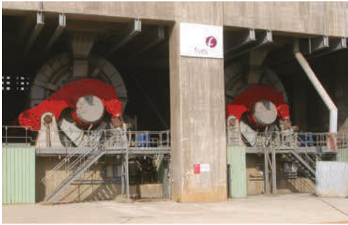
The Twin-FCB Horomill® for high capacity grinding plants

The combination of two identical FCB Horomill® grinding units operating simultaneously along with a large-sized FCB TSV™ Classifier.