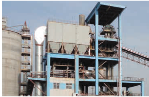
The FCB Aerodecantor to handle products up to 20% moisture

The integration of the drying function in the system.