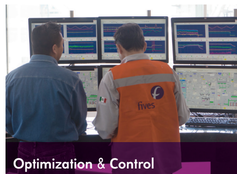
Optimization & Control

Fives also offers plant site services to support customers. Our worldwide team of experts provides responsive and relevant support for operation and maintenance of burning lines and grinding workshops, whatever the original manufacturer.