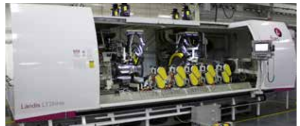
Inside of Landis LT2HHe