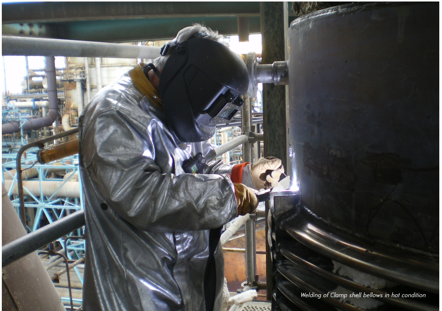
Welding of Clamp shell bellows in hot condition

Fives' Piping Solutions business line provides a wide range of services to manage the Expansion Joints in your facilities