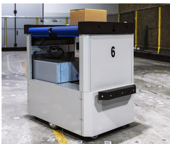
New GENI-Ant model