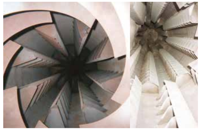
Drying and cooling tubes

With more than 200 references worldwide, the Cail & Fletcher dryer-cooler fully satisfies the highest requirements of any plant – cane, beet or refinery.